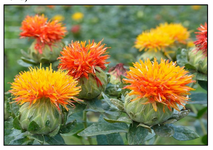
Figure 19: Prunus dulcis

The clinical trial has been conducted on primiparous women who went to a pregnancy clinic in turkey. Three groups of participants were created: primiparous women applying bitter almond oil with massage (n = 47), primiparous women applying bitter almond oil without massage (n = 48), and primiparous women in the control group (n = 46). Result indicate significant difference among three groups, as 20% striae appeared in first group