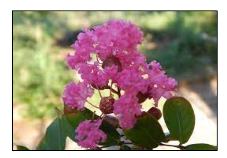
Figure 9: Lagerstroemia indica

In India, Lagerstroemia indica flower (LIF) has been widely used as diuretic. Research conducted on Lagerstroemia indica flower extract (LIFE) to identify the possible mechanism behind stretch mark treatment. Result revealed that Lagerstroemia indica extract is beneficial cosmetic agent on alleviating striae distensae as it promotes synthesis of extracellular matrix (ECM) in fibroblasts and suppresses the fibronectin -induced mast cell activation. Moreover, LIFE suppresses RBL-2H3 on fibronectin (FN) and attenuated the allergen-induced granules. (5, 24)