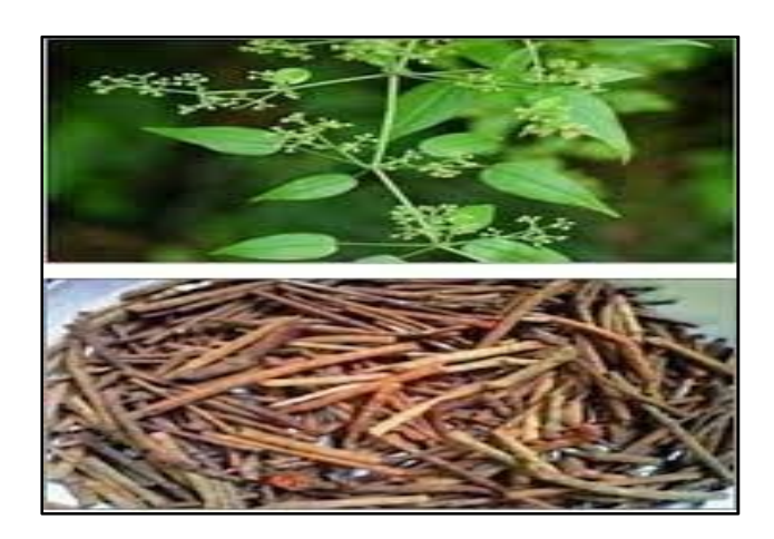
Figure 6: Rubia cardifolia

In a randomized trial, 30 females were taken up for the study. Stretch marks were observed before trial then ManjisthaGhrita was given for 30 consecutive days. After 30 days of study, females were examined for changes in kikkisa(Striae gravidarum). The result data was interpreted statistically using Paired T test, Wilcoxon test, by using SPSS Software. The obtained data revealed that Rubia cardifolia possess anti-stretch mark activity by promoting collagen formation. Previous literature states that Manjistha is widely used in cosmeceutical industry as it have Ropana- Sothahar property, kandughana, vishghana, pittashmak property and beneficial in skin burning, improving skin texture, itching and hypopigmentation. (18, 19)