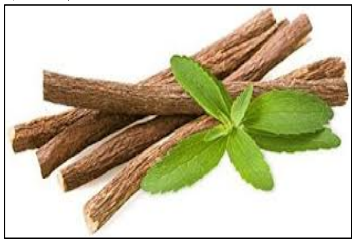
Figure 16: Glycrrhiza glabra