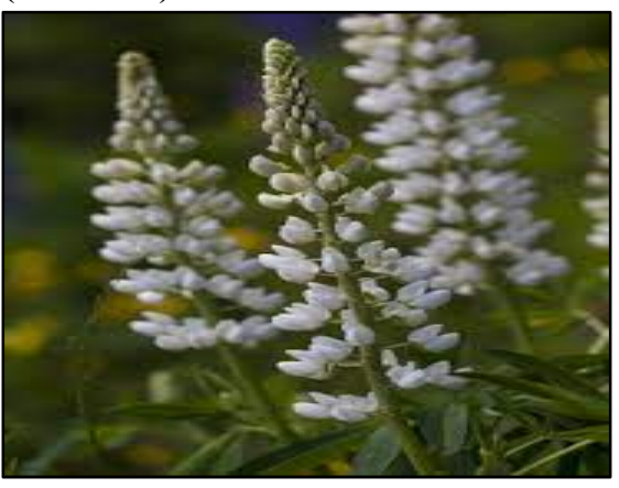
Figure 18: Carthamus Tinctorius

Many parts of the plant Carthamus Tinctorius like, seeds, flowerare widely utilized as medicine as anti-pyretic, anti-diabetic, analgesic, anti-neoplastic, boost hair growth, promote weight loss and cure breathlessness. Additionally, Carthamus Tinctorius seed oil has been reported to manage stretch marks and lessen scars, when applied topically to the skin. (33)