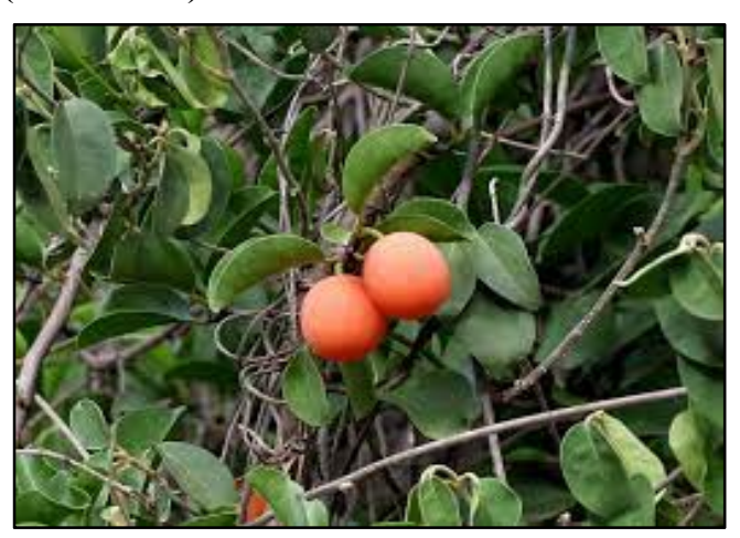
Figure 15: Berberis aristata

The study intended to evaluate the clinical efficacy of Berberis aristata in preventing kikkisa. The trial is based on comparing two plants Daruharidra and Yashtimadhu gel activity on striae gravidarum. The research is completely based on signs of Rekha Swarup TwakSankoch (stretch marks present on abdominal wall), Kandu (Itching), Daha (burning sensation), and Vaivarnya (discolouration). A conclusion was reached after careful observation and analysis that Daruharidra and Yasthimadhu are potent medicinal plants used to protect and treat the skin due to their antimicrobial, antibacterial, as well as wound-healing, characteristics. Berberis aristata could be the choice of plant to prevent striae gravidarum. (31)