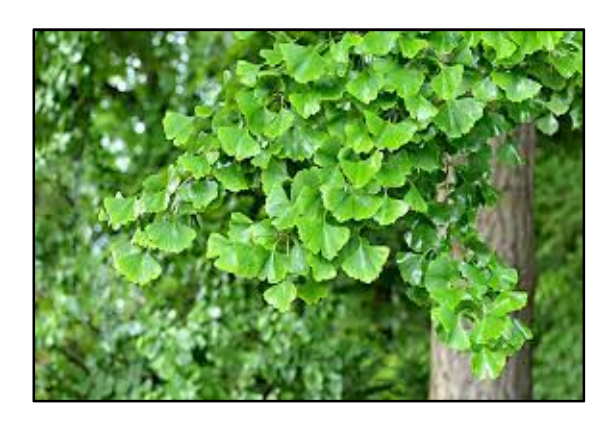
Figure 12: Olea europaea

The aim of this study is to investigate the clinical efficacy of Olea europaea in prevention and reduction in stretch marks (SG) by using Fitzpatrick Skin Type Scale and Davey's Severity Score. In this randomized controlled trial, 156 Turkish pregnant females were randomly assigned during their last trimester for the trial and separated into intervention group and control group. Olive oil was applied to test group women, two times a day on abdomen and control group applied placebo. The females' striae severity (incidence and type) were considerably decreased in intervention group compared to control group. Moreover, the level of incidence of striae gravidarum in the test group is 50% and in control group is 69.2%. Davey's Severity Score of test group is 2, which is less severe than control group score i.e. 4 (more severe). Hence, indicates that olive oil is clinically efficient to treat and prevent the progression of stretch marks. (27, 28)