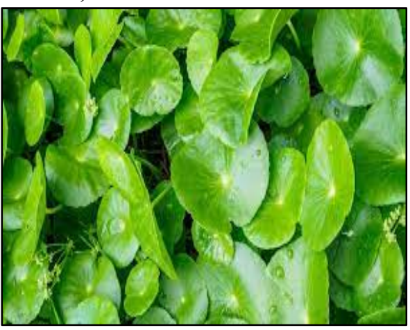
Figure 2: Centella asiatica

According to research studies (Quasi-Experimental), Centella asiatica was tested on 12 participants (postpartum mothers, day 0-6) having stretch marks, carried out at the Independent Practice Midwife (IMP) ZummatulAtika. Paired T-test result indicates significant difference in striae gravidarum particularly in terms of skin moisture and texture, after and before using a lotion containing Gotu kola extract. Stretch marks took between 6 and 10 months to go from dark to light, turn white (alba), and flatten out. Stretch mark lines decreased from 5–10 (pre–test) to 1–5 (post–test). (4) In accordance to a study, gotu kola contains glyceryl to moisturize the skin and sodium lauryl sulphate (SLS) to remove filth. (12) A review of the literature revealed that massage with bitter almond oil and Centella asiatica could both prevent and lessen the severity of SG (Striae Gravidarum). (1) Moreover, skin hyperpigmentation and stretch marks can be treated by oral supplementation of Gotu Kola by elevating skin's collagen production and keeping the skin moistened. (13).