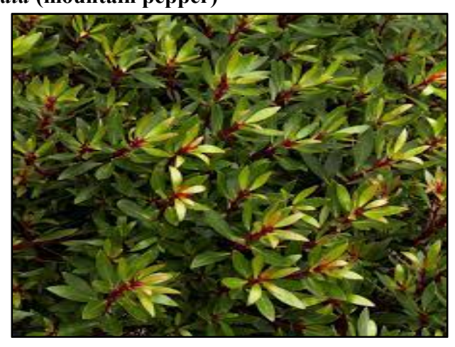
Figure 10: Tasmannia lanceolata