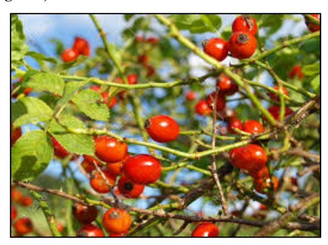
Figure 17: Rosa canina

Rosehip is known to be a pseudo fruit of the plant Rosa canina , which is found in Eurasia. Previous investigation revealed that rosehip has been used in food manufacturing, especially in herbal tea due to the presence of vitamin E and ascorbic acid in high amount. Additionally, rosehip is enriched in carotenoids and phenols along with vitamin C, which indicate its antioxidant activity. Rosehip is used topically for the management of striae distensae. (32)