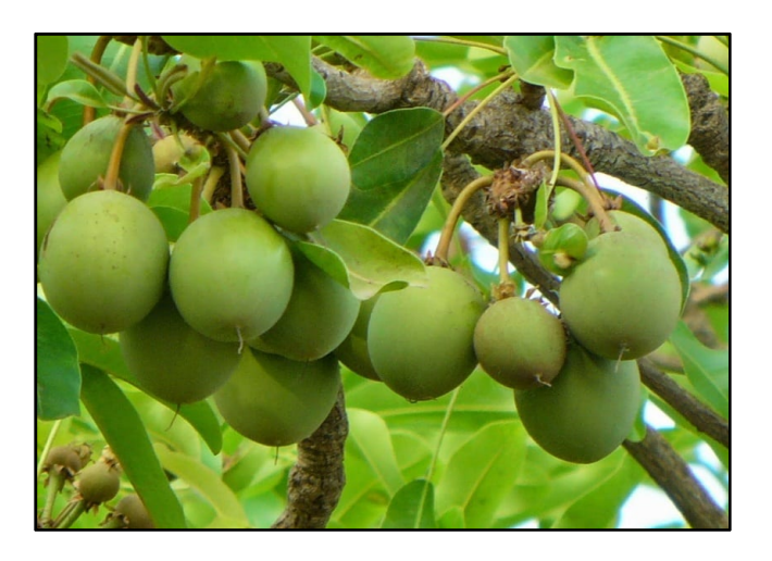
Figure 8: Vitellaria paradoxa

Shea butter was prepared from the tree Vitellaria paradoxa . Shea butter contains vitamin A naturally, which makes it suitable choice for using in curing stretch marks, hydrated skin, healing properties and reducing scars. Additionally, Shea butter works by smoothening and softening of skin by modifying cellulite appearance. (22) Shea butter is advisable for both prevention and treatment of kikkisa (Striae gravidarum). It keeps the skin hydrated, maintain and regain elasticity and firmness of the skin during pregnancy, which ultimately prevent stretch marks to appear and also reduce them if used after childbirth. (23)