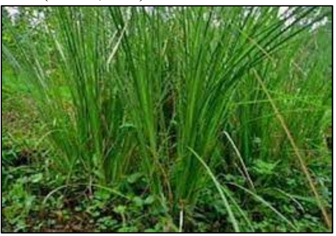
Figure 11: Chrysopogonzizanioides

Vetiveriazizanioides, also known as vetiver or khus, is grass which uncontrollably grows in periodically flood inundated tracts, of western and north-central India. Through the process of steam distillation, the essential oil is collected from the roots, which aids in the replacement of dead and discolored tissues in the damaged areas with new tissues, giving the area a more uniform appearance. Furthermore, Chrysopogonzizanioides founds useful in stretch marks after childbirth, scarring and fat cracks. (26