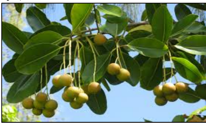
Figure 20: Lupinus albus

Research studies stated that Lupinus albus is clinically proven to increase collagen in the skin. In this, 28 womens were randomly selected for applying the topical formulation of Lupin seed extract and skin treatment oil(5ml) for about 12 weeks daily. The comparative study result showed that Lupin seed extract formulation improves the elasticity of skin by 16% in comparison to other oil and could be the choice of anti-stretch mark oils. (3)