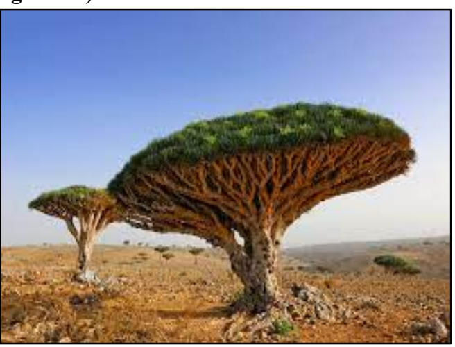
5. Figure 5: Croton lechleri

In a non- randomized in-vivo study, 20 healthy women of age 21-48 years were choosed with the aim to observe the difference at epidermis and dermis level in test group and control group. Test group was given an emollient oil-in-water cream which is formulated from Croton lechleri (Dragon's blood) resin extract and P. granatum seed oil. Result suggested Croton lechleri can be used to prevent striae as it boosts collagen production, regenerate epithelia and stimulates fibroblasts proliferation and migration due to the presence of constituents like; proanthocyanidins, taspin and principal alkaloid catechin. Previous research revealed Croton lechleri potential as antioxidant, anti-inflammatory and healing properties. (17)