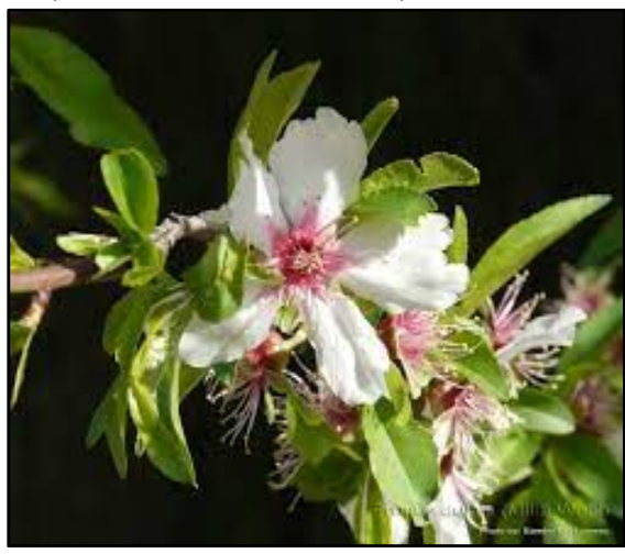
Figure 21: Calophylluminophyllum