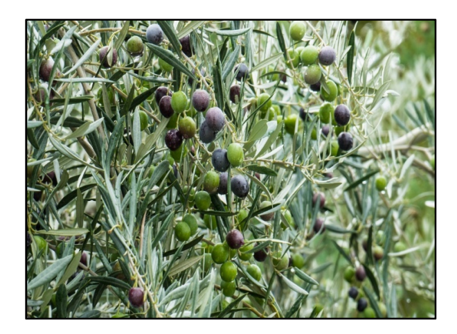
Figure 13: Ginkgo biloba