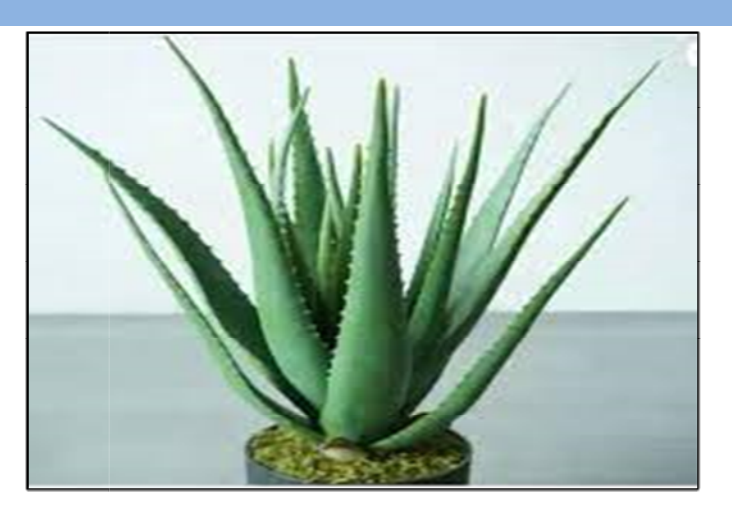
Figure 3: Aloe Vera

The Aloe Vera plant has stiff lance-shaped gray-green leaves with a mucilaginous pulp and people have known this from ages for its therapeutic and skin-care benefits. The plant have extraordinary capacity to accelerate the production of fibroblasts cell by 6-8 times higher than normal and to generate collagen and elastin fibres, which make the skin more elastic and less wrinkled, aloe offers tremendous anti-aging effects. (14) In double-blind clinical trial, 160 nulliparous women were included and the study's variables (itching, erythema, and spread of striae) were examined using statistical tests in SPSS after dividing women randomly into 4 groups, from which 1,2,3 groups were treated with 700 g Aloe Vera, sweet almond oil, and base cream. Whereas, 4<sup>th</sup> group(control group) was treated with only base cream. Result revealed that tested aloe vera cream was able to reduce itching, erythema and treat stretch marks (p<.05); as compared to the control group. (15) Mucopolysaccharides present in aloe vera aids in retaining moisture of the skin. (3)