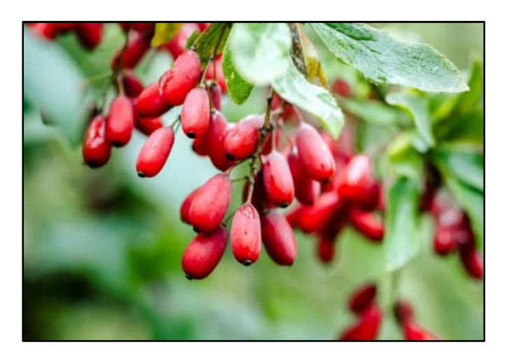
Figure 14: Ximenia Americana

The wild plum,or Ximenia americana L., is a tiny evergreen tree in the Olocaceae family, which blooms all around the year and is originated in tropical Africa, and is currently found in many locations including the Western Islands, New Zealand and south America. It can withstand droughts and thrives in rocky soil. However, the oil extracted from Ximenia Americana tree's seeds is the most valuable component which is widely used by locals in southwest Angola, mostly as a cosmetic for the skin—to moisturise, smooth, promote skin elasticity, reduce appearance of kikkisa (stretch marks in pregnant female), and condition hair. (30)